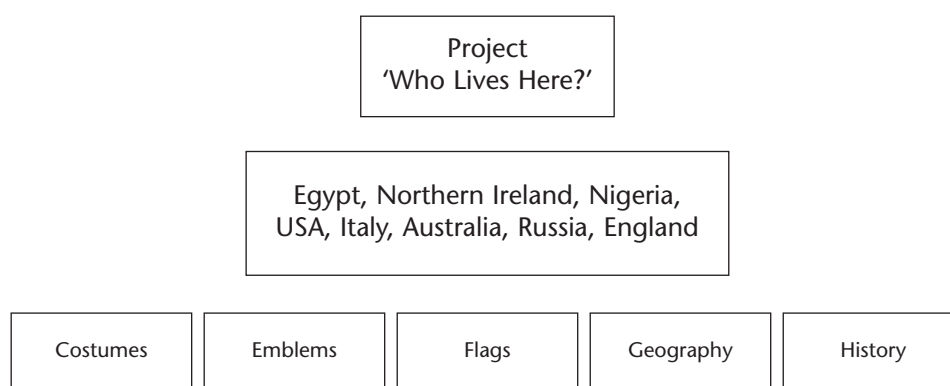
Figure 1: Topics researched

The next stage of the project involved children researching the historical and geographical backgrounds of the countries from which identified families had come. Pupils worked in groups of three or four, deciding on which country they wished to gather information about and on what aspects. Much of the research was done using the internet. We set aside one hour per day when pupils accessed the classroom computers and the school computer room. However, much of this work was done by the pupils after school, meeting in their respective homes. Figure 1 highlights the topics which pupils researched at this stage.